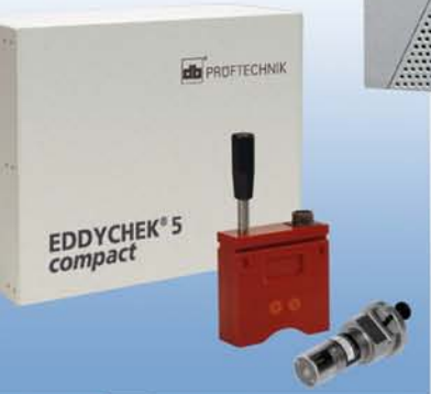
Segment coil & E probe