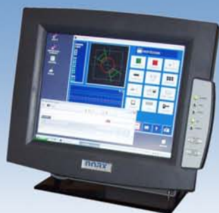
Industrial PC panel with touchscreen