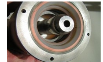
Figure 2 – Eddy Current Probe Detail